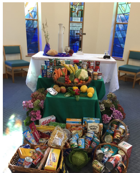
Our harvest gifts were taken to the Grace Food Bank

'For the harvests of the Spirit, thanks be to God; for the good we all inherit, thanks be to God; for the wonders that astound us, for the truths that still confound us, most of all, that love has found us, thanks be to God.'