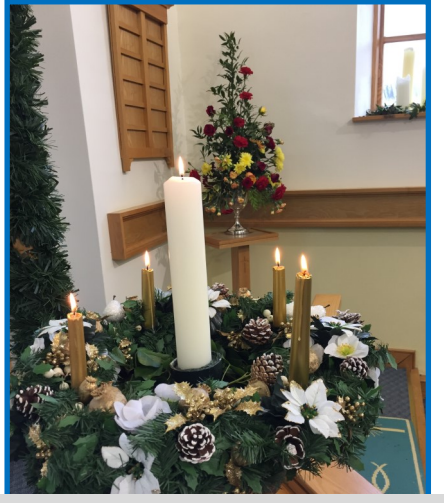
Advent Wreath - four gold candles were lit during each Sunday in Advent and finally the central white candle was lit on Christmas Day.